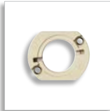
Lamp holder PGJX28 MiniFastFit