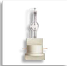
Philips MSR Gold™ 1200 FastFit

gaps and more compact filaments lead to a higher beam intensity and better performance. Philips FastFit lamps have an increased brightness and excellent color quality. On top of that, all Philips FastFit lamps have the Philips pinch protection and are available for both Halogen and HID lamps, which means a single fixture can be used for both lamp types.