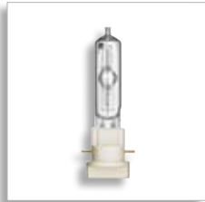
Philips MSR Gold™ 300 MiniFastFit New! Philips MSD Gold™ 300/2 MiniFastFit New! Philips MSR Gold™ 700/2 MiniFastFit