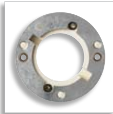
Lamp holder PGJX50 FastFit